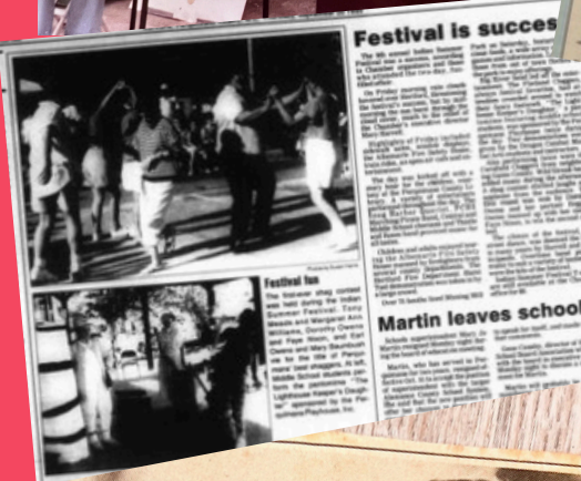
Festival is successful

The 18th annual Indian Summer Festival was a success, drawing thousands of people to the waterfront pavilion and the downtown streets of Hertford. The festival featured a variety of activities, including a parade, a dance performance, and a concert. The Perquimans County Chamber of Commerce organized the event, which was held on Saturday, September 12, 1987.