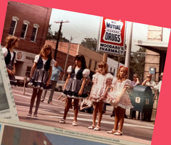
The daily newspaper for and about Perquimans County people