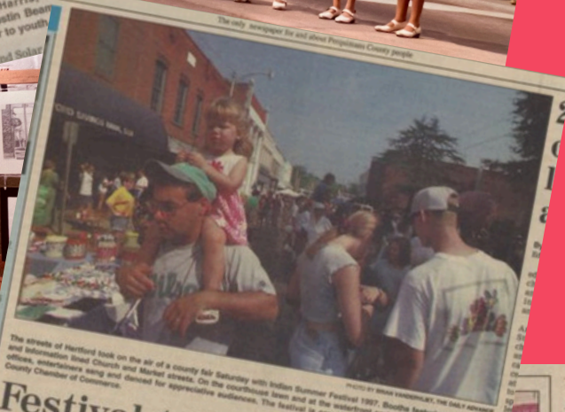
The streets of Hertford took on the air of a county fair Saturday with Indian Summer Festival 1987. Booths featuring crafts, food and information lined Church and Market streets. On the northeast lawn and at the waterfront park behind the Hertford town offices, entertainers sang and danced for appreciative audiences. The festival is organized and promoted by the Perquimans County Chamber of Commerce.